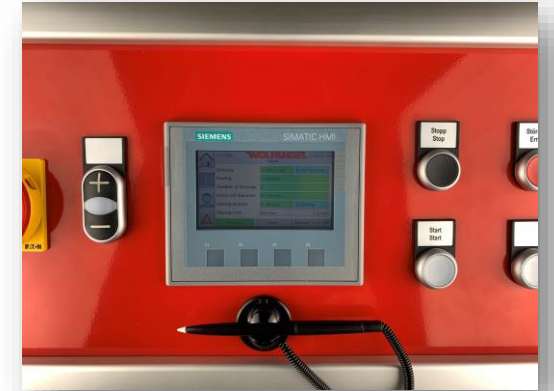
vario.cutter E with 4" HMI