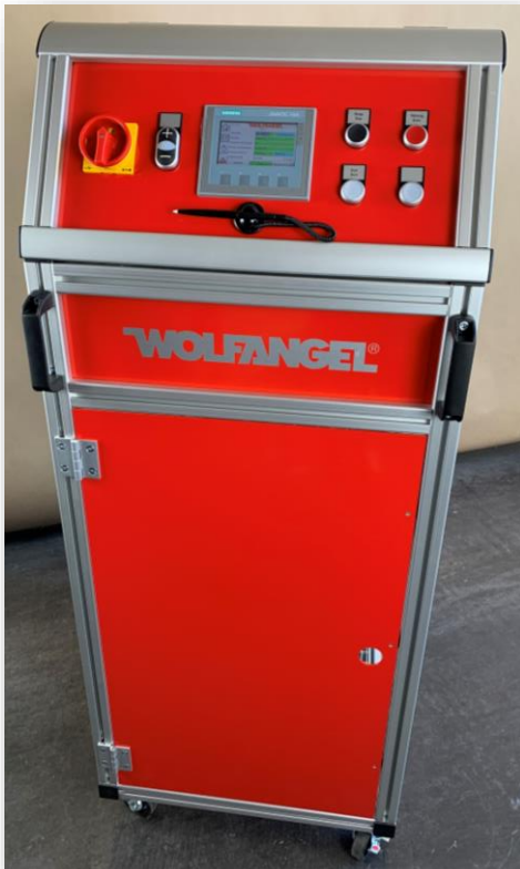
vario.cutter E with housing