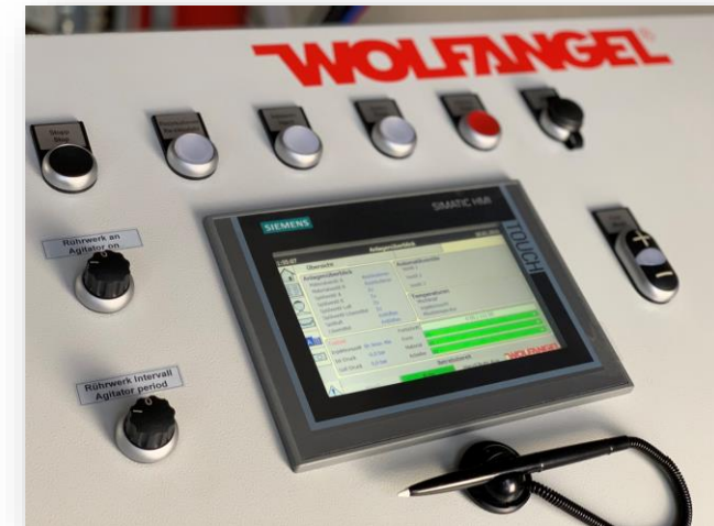
iJect touch UP Control panel with 7" colour touch display