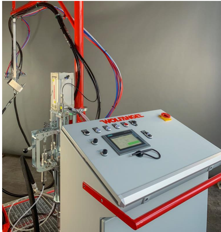
iJect touch UP Cart with boom