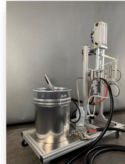
Gelcoater 44 on mobile cart