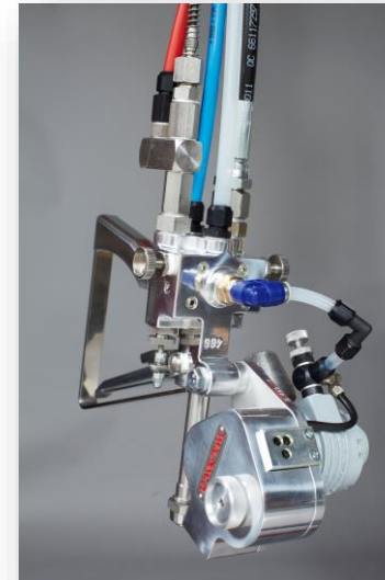
Chopper gun with cutter SW II