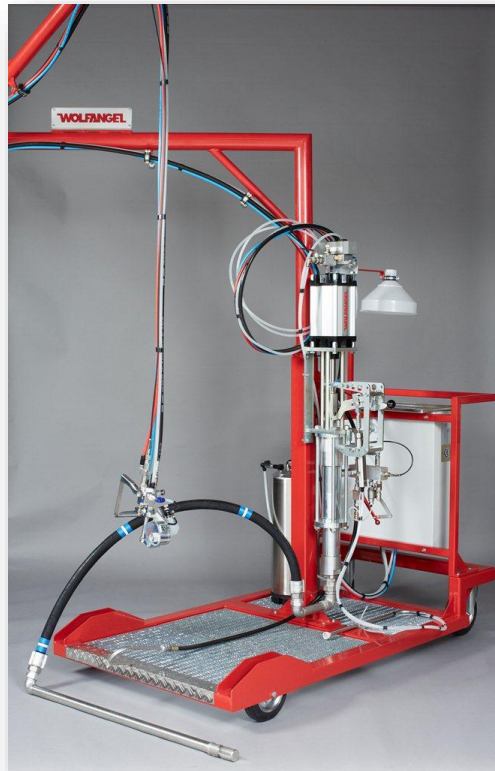
Chopper 150 with optional cart and boom